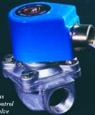
Gas Control Valve