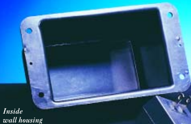
Inside wall housing