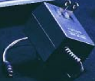
Standard AC adapter